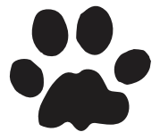
Domestic Cat 1 1/8"