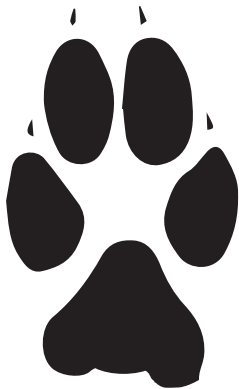
Coyote 2 1/4" - 2 1/2"

There are 3 lobes, but the center lobe is shorter than the other 2