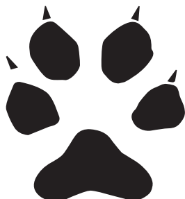
Domestic Dog 1 1/2" - 4 1/2"

There are 3 lobes, but the center lobe is shorter than the other 2